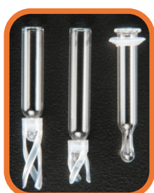
4005BS-625, 4025BS-529, 401TS-529