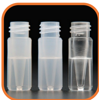
30510P-1232, 30510CP-1232, 30510T-1232