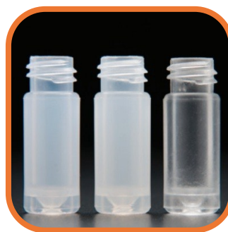
30710P-1232, 30710CP-1232, 30710T-1232